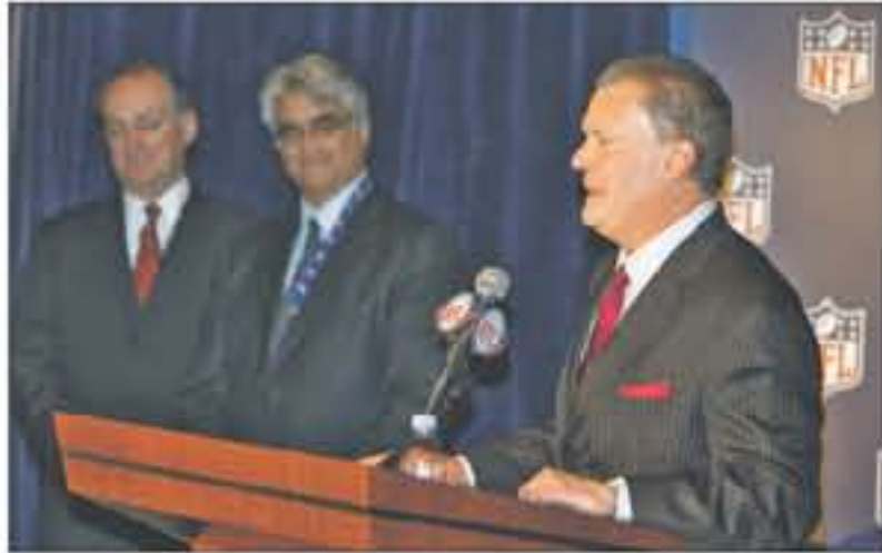
SAM RICHE / The Star

It calls for turning around an area twice the size of Fall Creek Place, a redevelopment project in a 17-square-block area near Downtown that transformed a crime-ridden neighborhood into one that at-